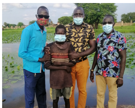
Baptisms in South Sudan