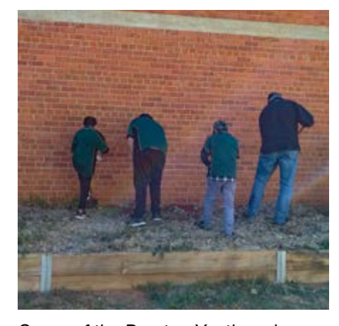
Some of the Dareton Youth and Community Centre youth getting stuck into helping grow their own food for cooking lessons.

Things are growing in Dareton literally! The Dareton Youth and Community Centre, NSW, has established a community garden. There is excitement around building a shade house soon for the vegetable garden with Parkdale Church of Christ partnering to fund its construction. Ilker, the youth centre Director, is determined to make full use of the garden's produce. The cooking sessions and eating from the Turkish-style BBQ are a highlight! The Centre is also seeing strong ongoing attendance with around 15-18 young people coming each of the four days it's open.