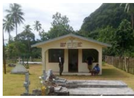
Yekar Church of Christ