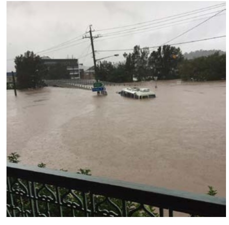
Lismore Flooded.

Find out more or give to the appeal at www.extend.org.au/floodsappeal