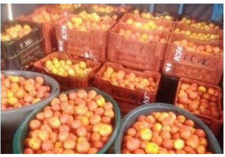
Above: Carrots and Tomatoes from the KCV Gardens, Zimbabwe. Below: Electrical repairs at Londua School, Vanuatu