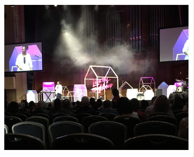
The Justice Conference

Members of both the GMP and embody team were at The Justice Conference, on the 27th and 28th October. See more on page 6.