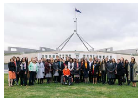
Micah Women Leaders Delegation at Parliament house

Micah Australia is a coalition of Christian international development agencies under the