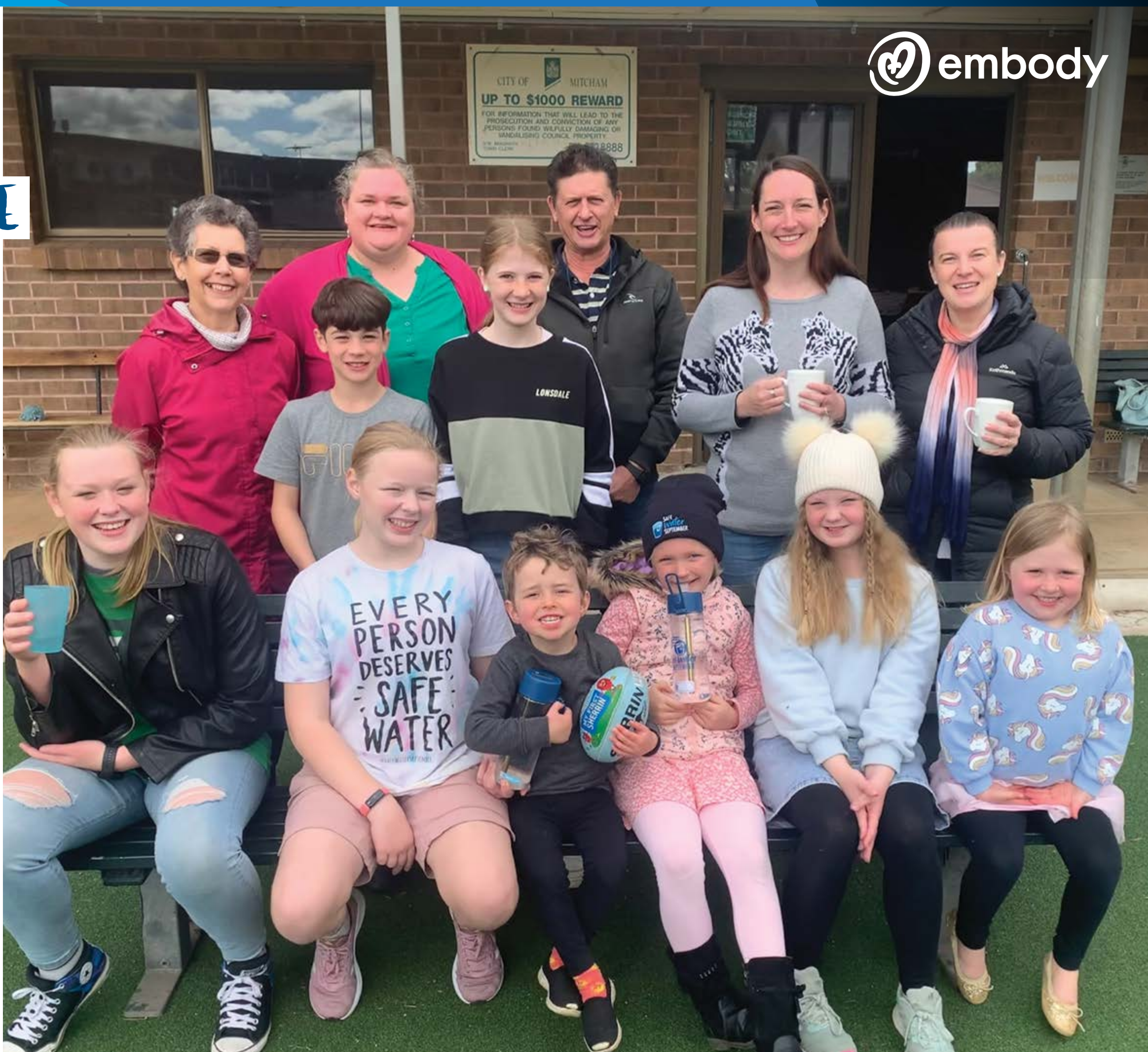
Image: The 2022 Safe Water September team from Hawthorn Church of Christ, South Austalia.

embody exists to empower, encourage and support a national community of young people who are passionate about mission. We want to see God's Kingdom come, to be the best stewards of the resources we currently have, and to support those who are the most vulnerable and marginalised in our world.