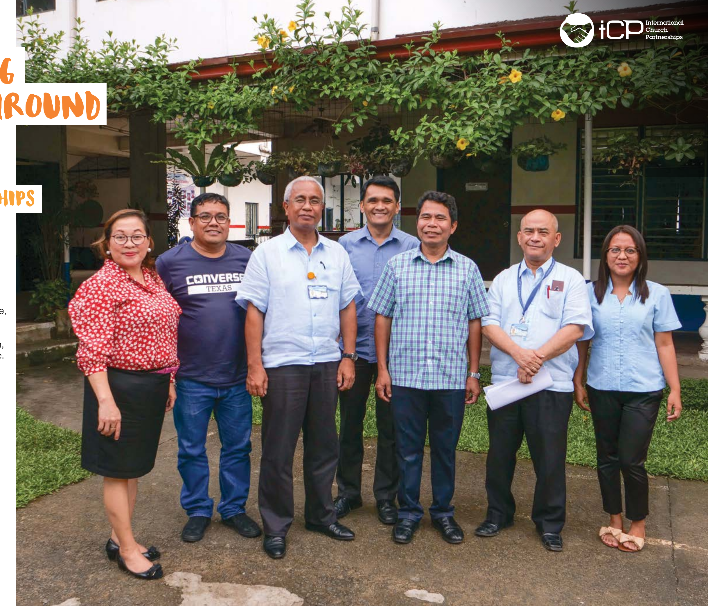
Image: Staff at The International Christian College of Manila (ICCM).

We do this by connecting Australian people and churches to those across the nations so that we can support, encourage, and resource the work of the gospel in Bangladesh, Fiji, India, Indonesia, Papua New Guinea, the Philippines, South Sudan, Thailand, Vanuatu, Vietnam and Zimbabwe.