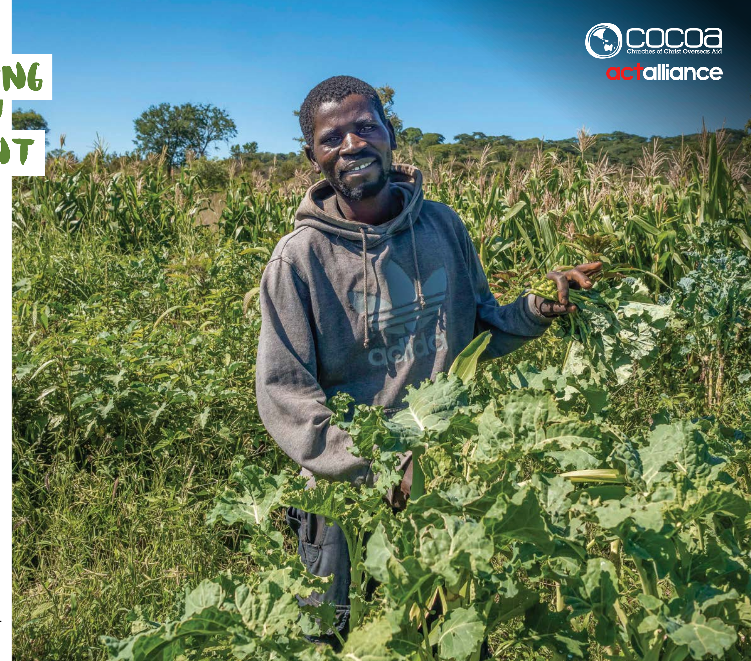
Image: Working in a vegetable garden made possible by Showers of Blessing Trust's (OSBT) water project, Zimbabwe, supported by the Australian Government through the Australian NGO Cooperation Program (ANCP).

COCOA works in Asia, Africa and the Pacific and its focus is on safe water, primary health care, quality schooling, productive livelihoods and peaceful relations. We partner with local civil-society organisations that are part of the communities they serve, letting their aspirations for well-being drive our projects.