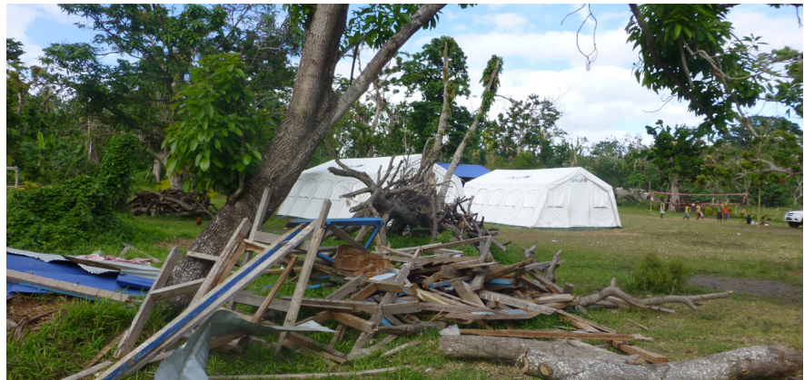
Damage and temporary classrooms after Cyclone Pam at Isla Mission School, Tanna. Isla has since been repaired and had classrooms rebuilt.