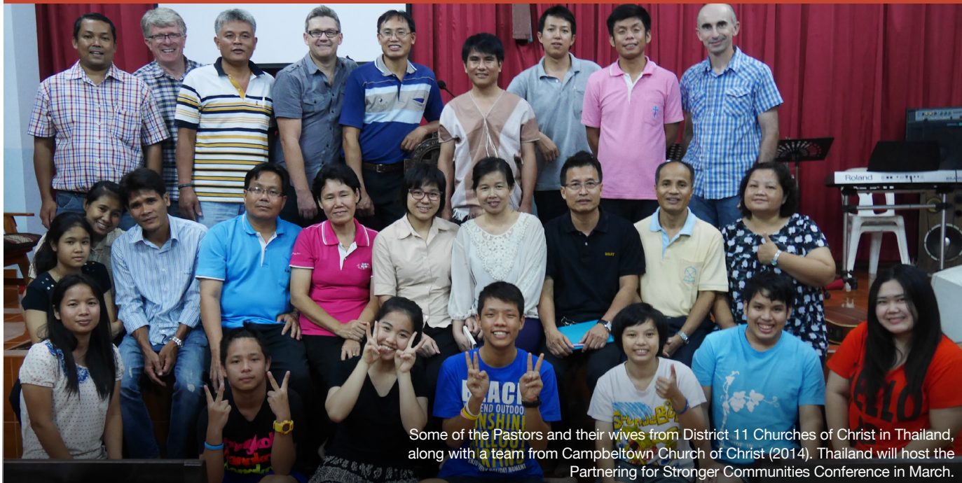
Some of the Pastors and their wives from District 11 Churches of Christ in Thailand, along with a team from Campbelltown Church of Christ (2014). Thailand will host the Partnering for Stronger Communities Conference in March.