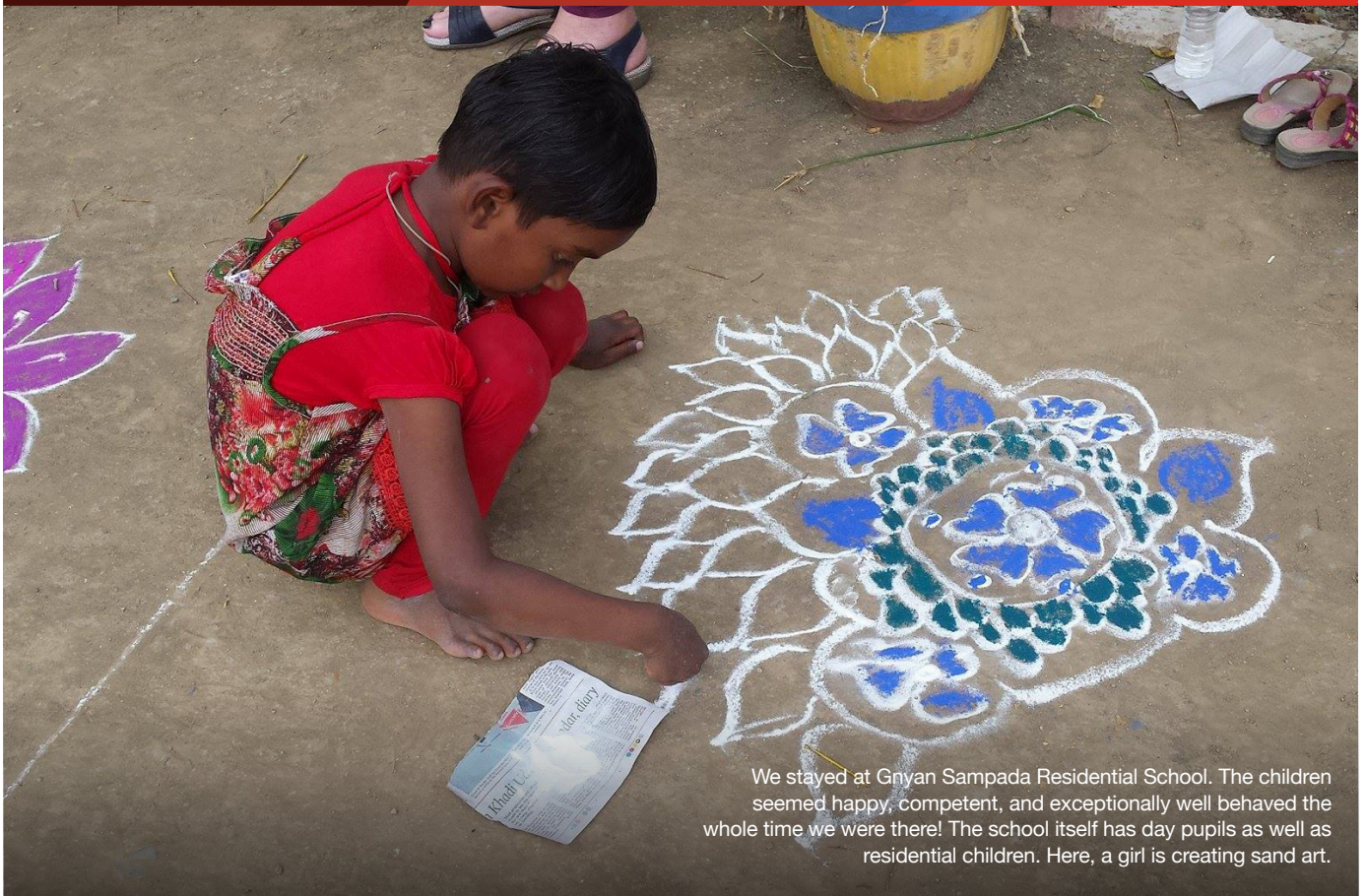
We stayed at Gnyan Sampada Residential School. The children seemed happy, competent, and exceptionally well behaved the whole time we were there! The school itself has day pupils as well as residential children. Here, a girl is creating sand art.