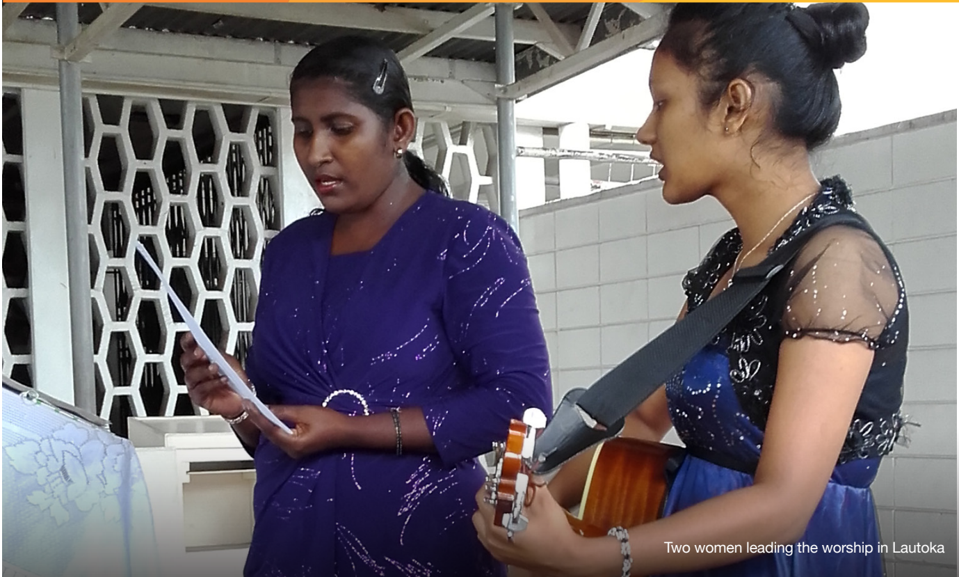
Two women leading the worship in Lautoka