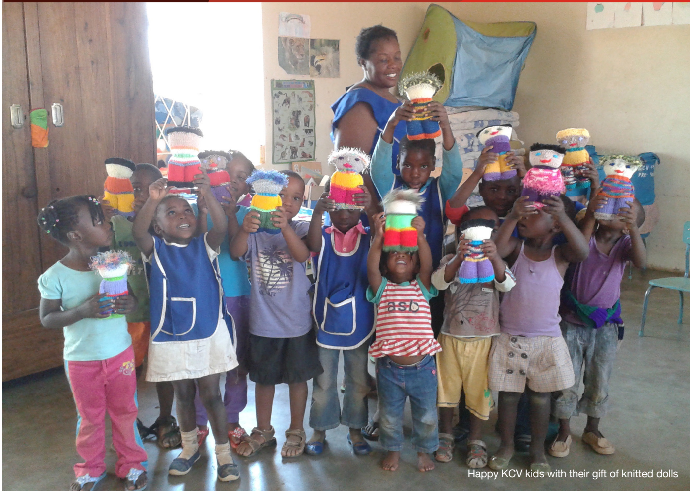
Happy KCV kids with their gift of knitted dolls