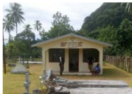
Yekar Church of Christ