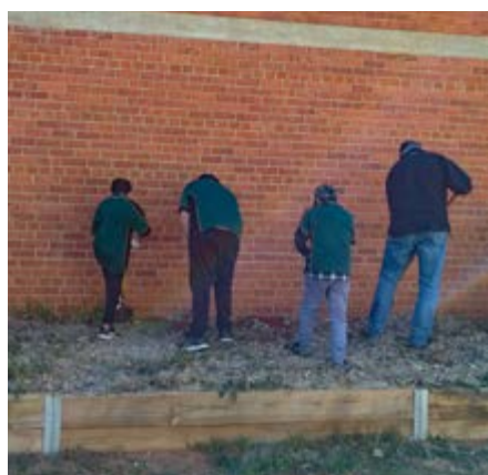
Some of the Dareton Youth and Community Centre youth getting stuck into helping grow their own food for cooking lessons.

Things are growing in Dareton – literally! The Dareton Youth and Community Centre, NSW, has established a community garden. There is excitement around building a shade house soon for the vegetable garden with Parkdale Church of Christ partnering to fund its construction. Ilker, the youth centre Director, is determined to make full use of the garden’s produce. The cooking sessions and eating from the Turkish-style BBQ are a highlight! The Centre is also seeing strong ongoing attendance with around 15-18 young people coming each of the four days it’s open.