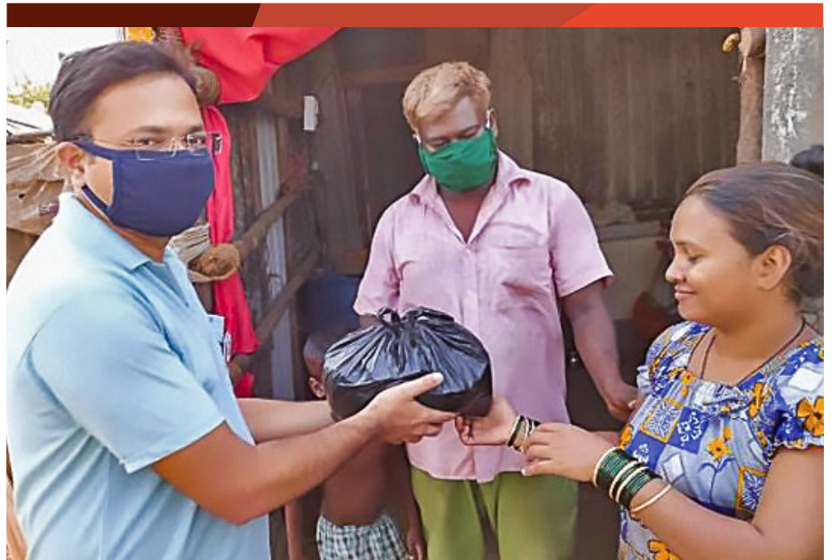
Hosanna Ministries, Mumbai