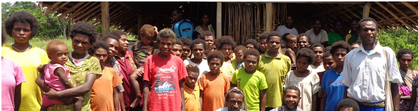
Pasinkap Church, PNG