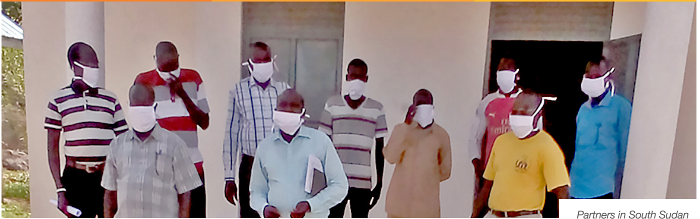
Partners in South Sudan