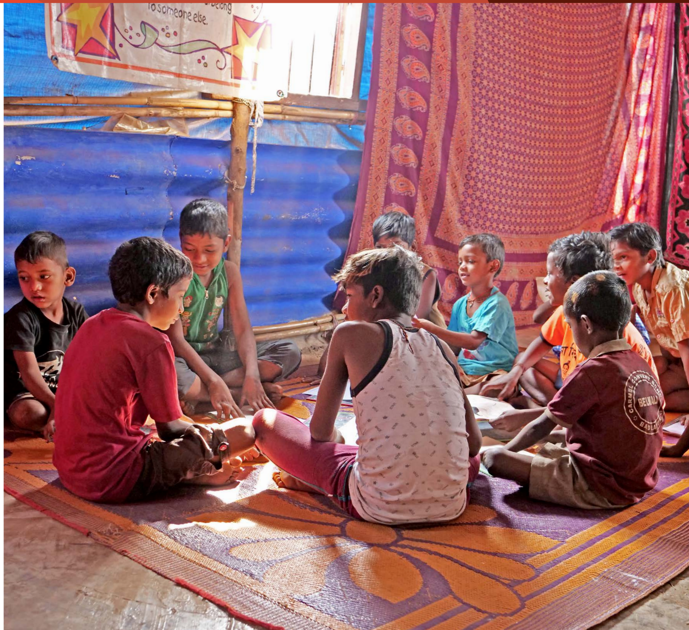
Children from Emmanuel Childcare Centre, Mumbai, India

People and programs are intimately linked in GMP. We don't have programs without people behind them, people sustaining them and people benefiting from them.