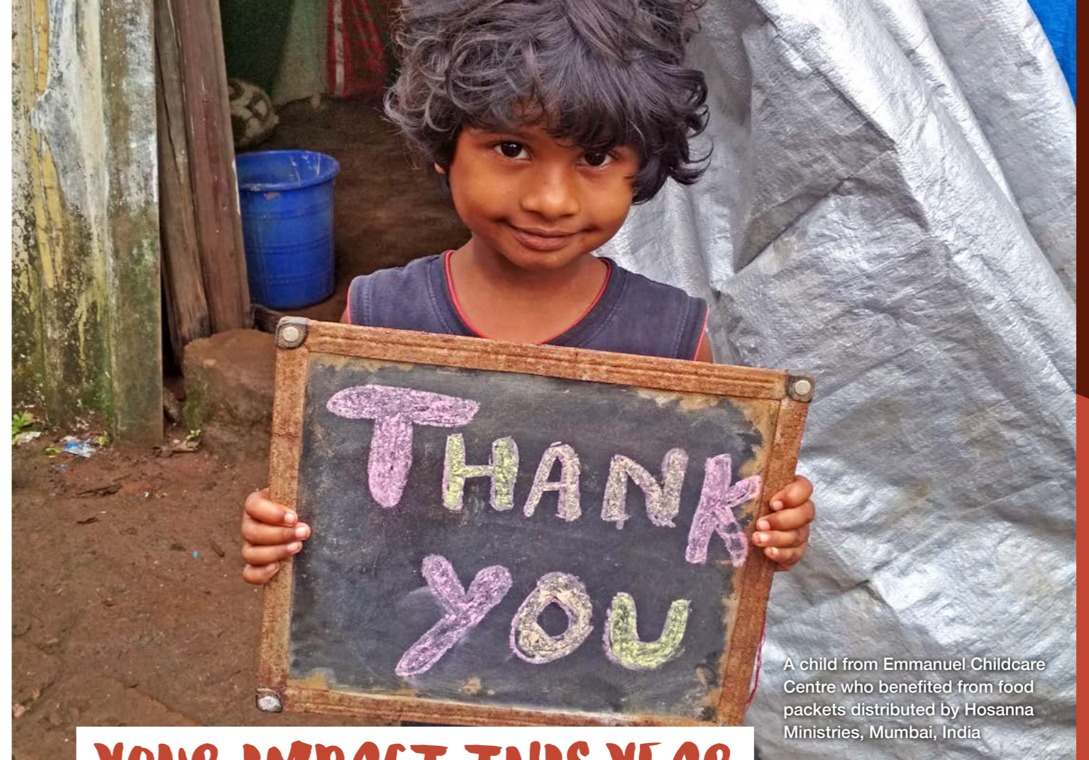
A child from Emmanuel Childcare Centre who benefited from food packets distributed by Hosanna Ministries, Mumbai, India