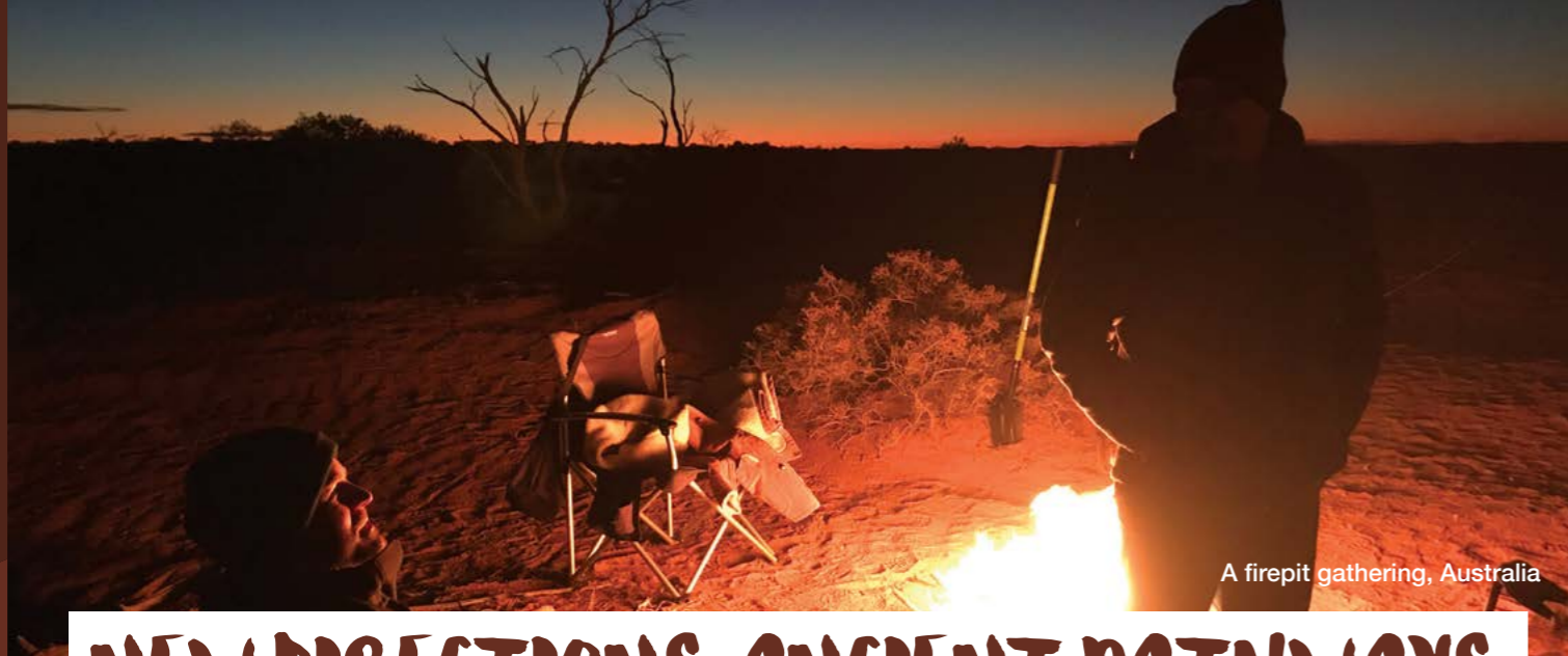
A firepit gathering, Australia