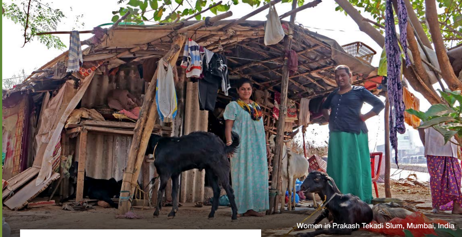
Women in Prakash Tekadi Slum, Mumbai, India