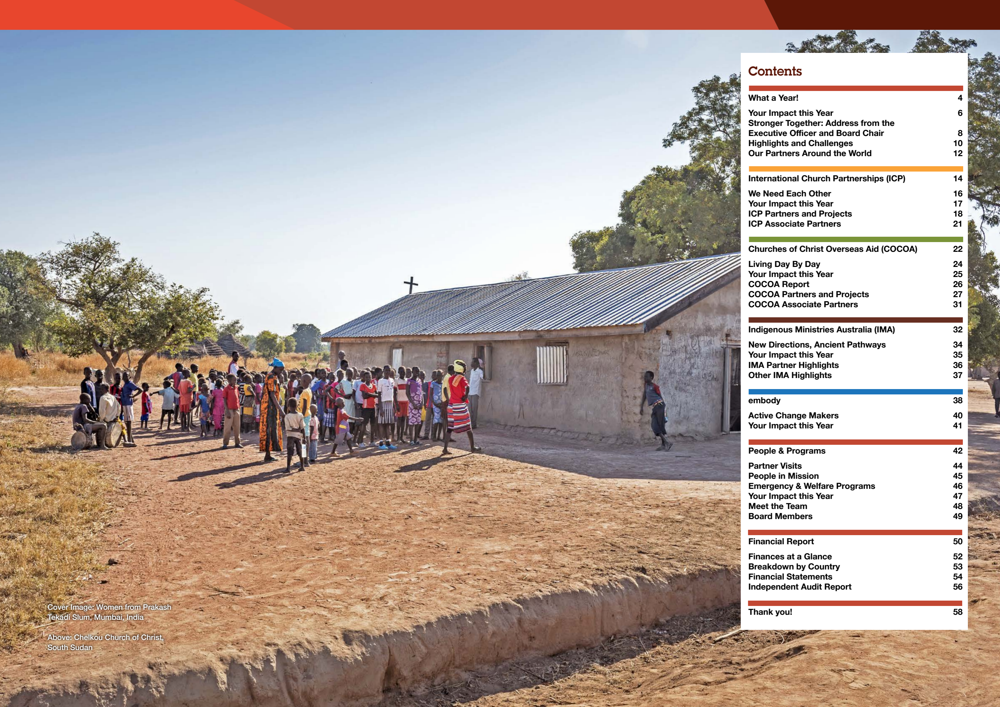
Cover Image: Women from Prakash Tekadi Slum, Mumbai, India