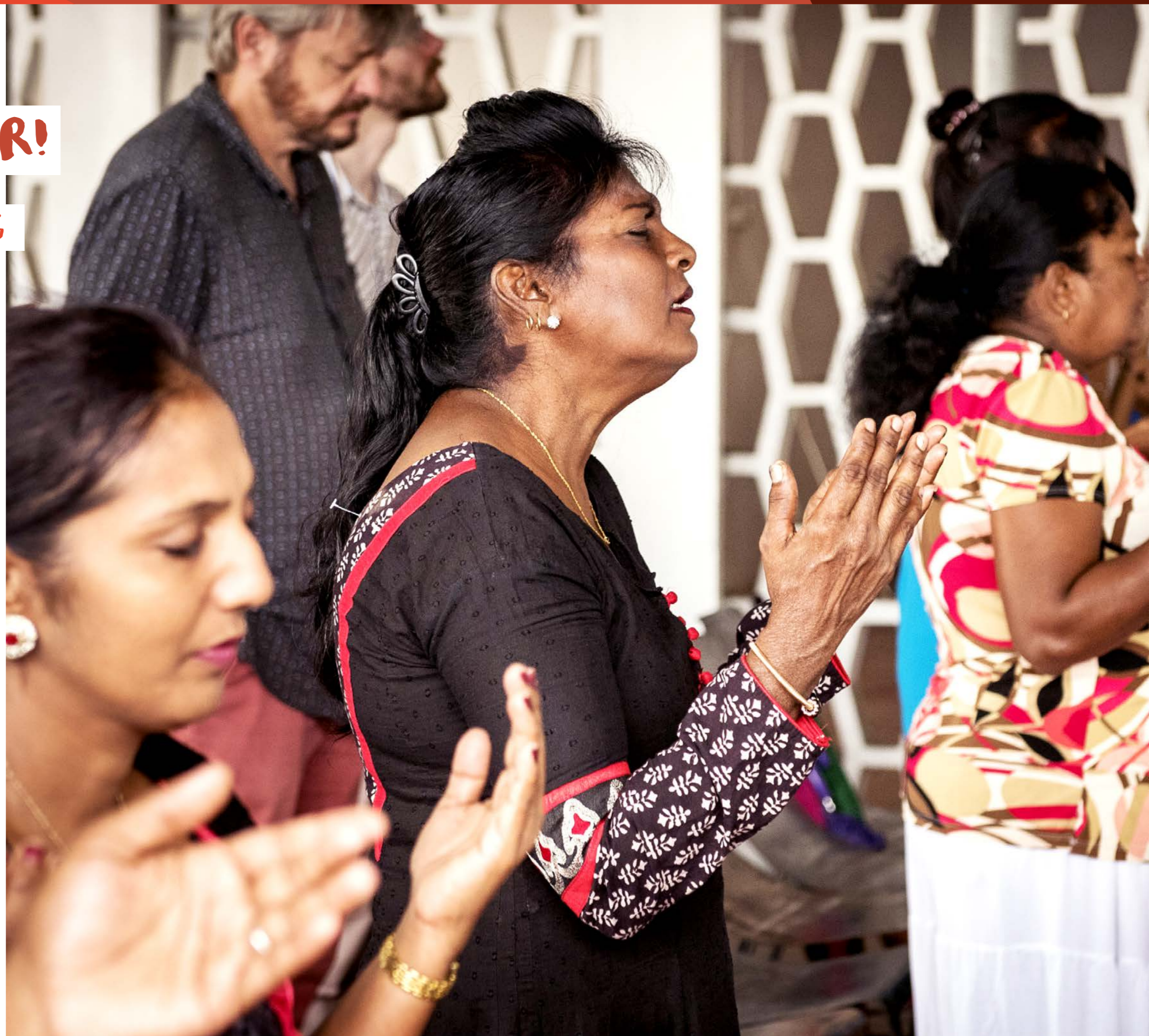
Image: Worship at Lautoka Church, Fiji

Every year, your impact is worth celebrating! Your generosity changes the lives of many, and makes a difference to people in need. Read on for a small selection of important highlights you've helped achieve.