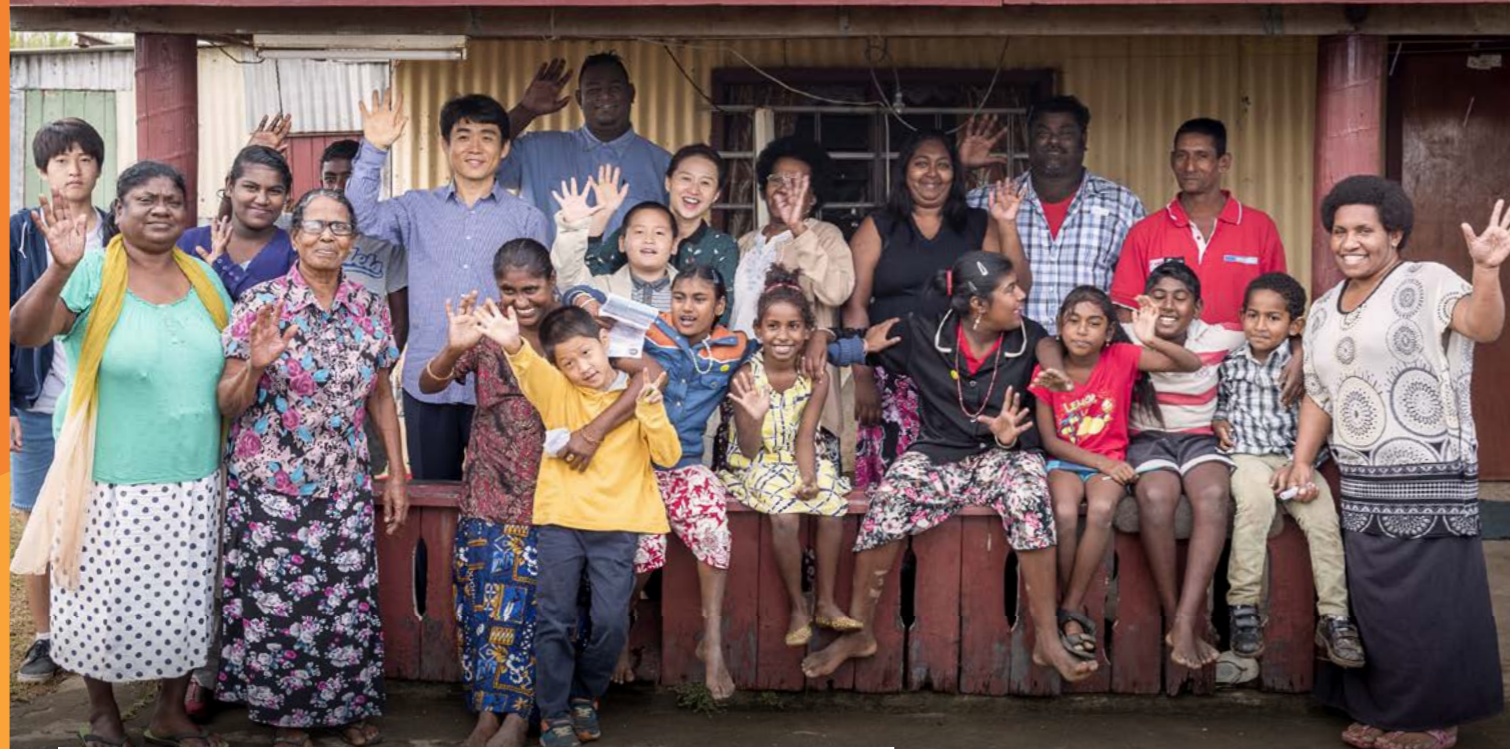
Members of Lomowai Church, near Sigatoka, Fiji