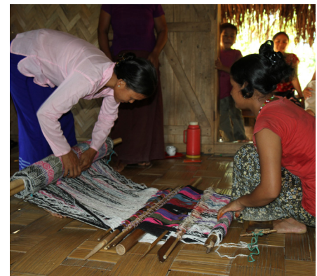
Women support local ministers with the small income they receive from handloom weaving.