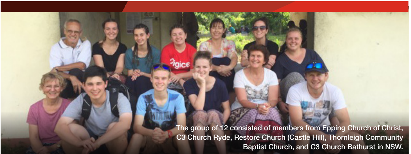
The group of 12 consisted of members from Epping Church of Christ, C3 Church Ryde, Restore Church (Castle Hill), Thornleigh Community Baptist Church, and C3 Church Bathurst in NSW.