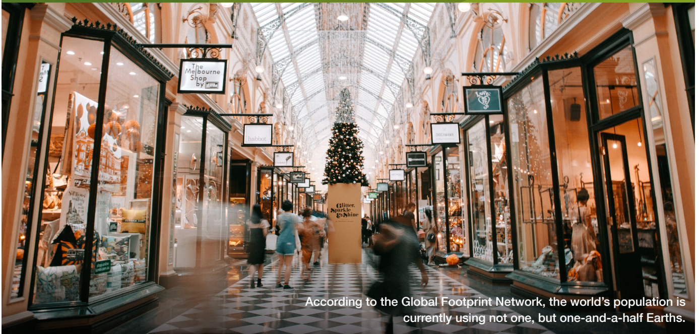
According to the Global Footprint Network, the world's population is currently using not one, but one-and-a-half Earths.