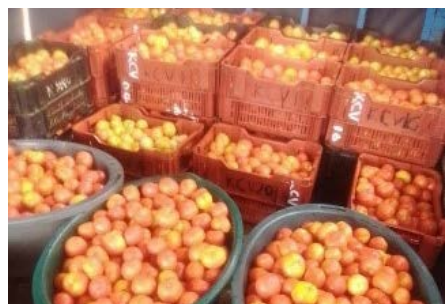
Above: Carrots and Tomatoes from the KCV Gardens, Zimbabwe.