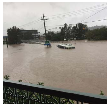
Lismore Flooded.

Find out more or give to the appeal at www.extend.org.au/floodsappeal