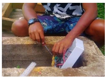
Below: Electrical repairs at Londua School, Vanuatu